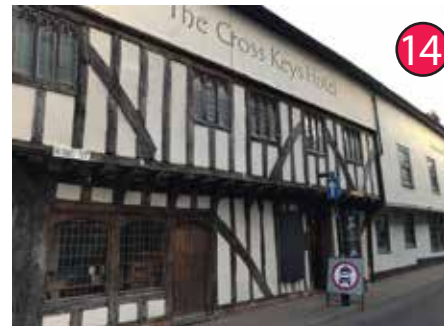
Cross Keys Hotel