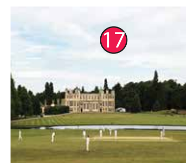
Audley End House