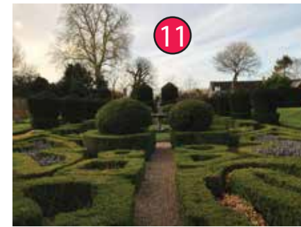
Bridge End Gardens