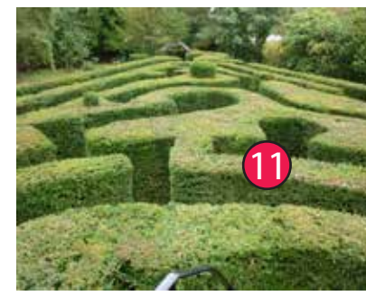
The Maze at Bridge End Gardens