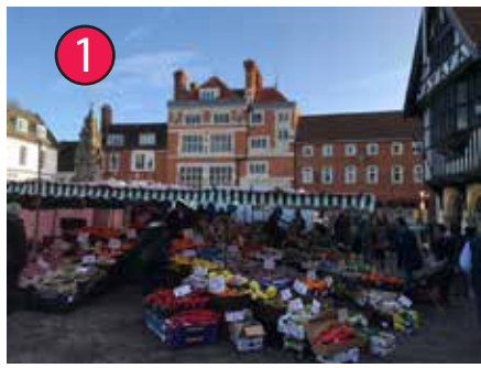
The Market Place