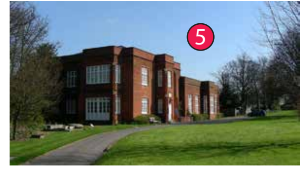
Saffron Walden Museum