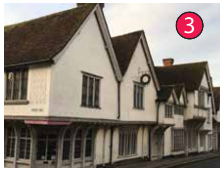
Old Sun Inn (Cromwell's HQ)