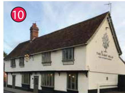
The Eight Bells