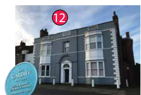
Jack Cardiff's residence